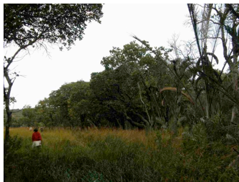
World Bank team in Lavushi Manda National Park