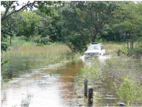
Kim crossing Mulaushi dambo in February

The year started very wet, with the water reaching the base of the lodge, flooding staff houses in Mulaushi camp and changing Mulaushi dambo into Lake Mulaushi! Boats were used to cross the 'lake' well into February which made reaching Wasa quite an adventure. In July the pontoon is still in use and Shoebill camp is still an island with no vehicle access yet.