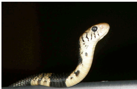
Young Black-necked Spitting Cobra, Wasa

At Wasa camp, a pair of the scarce and sought-after Böhm's Flycatcher successfully raised 2 young. The family was seen daily at the camp from the end of January up till 20 April, joining a large resident flock of five more flycatcher species and many other bird species.