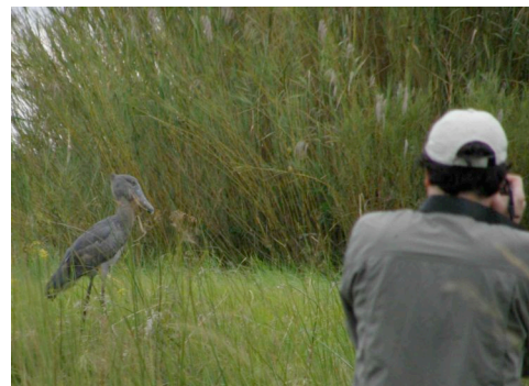
How close can you get to the Shoebill?

Other interesting observations include the resident Porcupine raiding the compost heap at Wasa, several family groups of Blue Monkey at Fibwe totaling at least 25 animals, and many sightings of groups of Elephant (some of the more cheeky ones damaging campsite buildings).