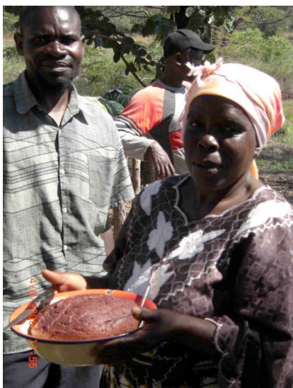
Contestants and their produce (chikanda) at the Natural Resources Competition