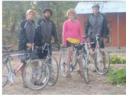
'Cycle of Life' Team in Kasanka Conservation Centre