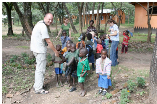
Kasanka School kids welcoming new staff members

The Education and Community programs are still going strong. In January a new academic year started for Kasanka sponsored students. We have accepted six new pupils: three girls for Mkushi High School, three boys for Serenje Technical High School and three pupils in nearby basic schools. The total of sponsored students is now 22!