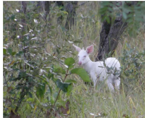
Albino Common Duiker near Wasa camp

One of the most surprising sightings in Kasanka was the discovery of an albino Common Duiker near Wasa camp. It is still present at the date of publication of this newsletter. A new curio (together with the puchwes - offspring of Puku and Black Lechwe) to our mammal list!